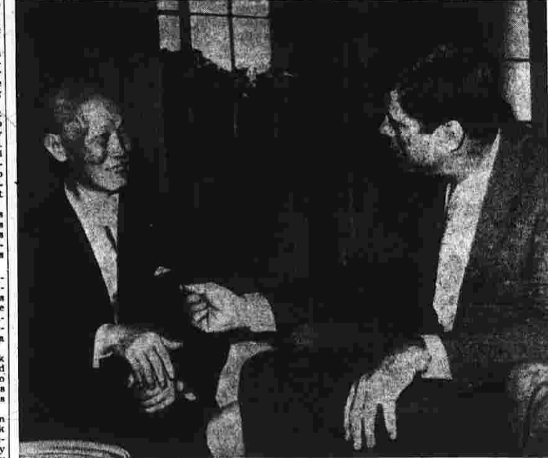
Chinese Nationalist Vice President and Prime Minister Chen Cheng listens to President Kennedy during a visit to his White House office this morning.